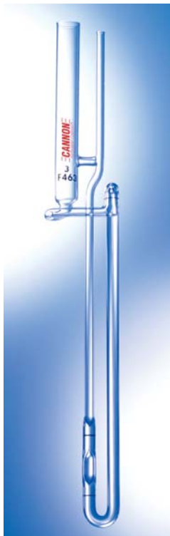
9723-S50 Series 9723-U50 Series